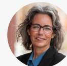
KATHLEEN WILLIAMS (MT-AL)