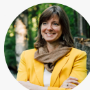
ALYSE GALVIN (AK-AL)