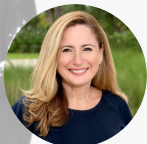
CONGRESSWOMAN DEBBIE MUCARSEL-POWELL (FL-26)